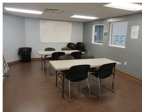
Puklich Chevrolet Community Room 1