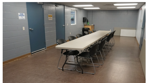
Puklich Chevrolet Community Room 2