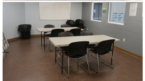
Puklich Chevrolet Community Room 1