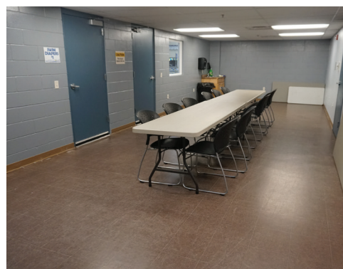
Puklich Chevrolet Community Room 2

*Diving well is only available during short course season.